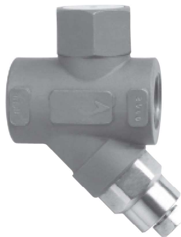
NTD600 Model Only: Canadian Registration # OE0591.9C