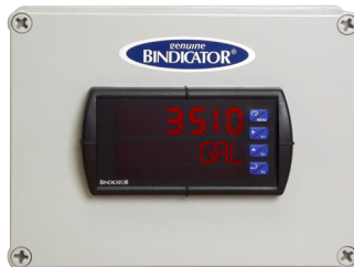
PRD1000 in NEMA 4X Enclosure

MSZ EN 60079-0:2013 MSZ EN 60079-0:2013/A11:2014 MSZ EN 60079-11:2012