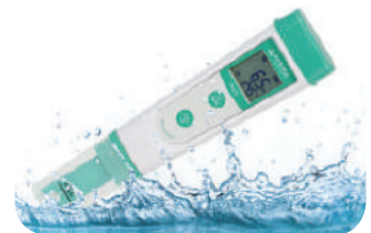
IP67 Waterproof and floatable